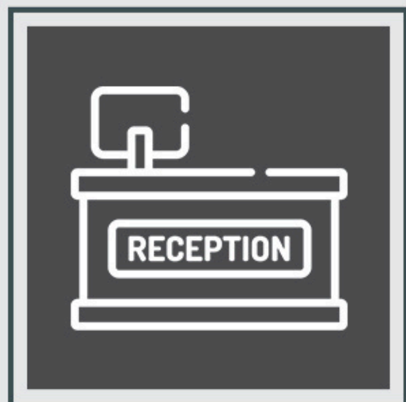
Concierge & Reception