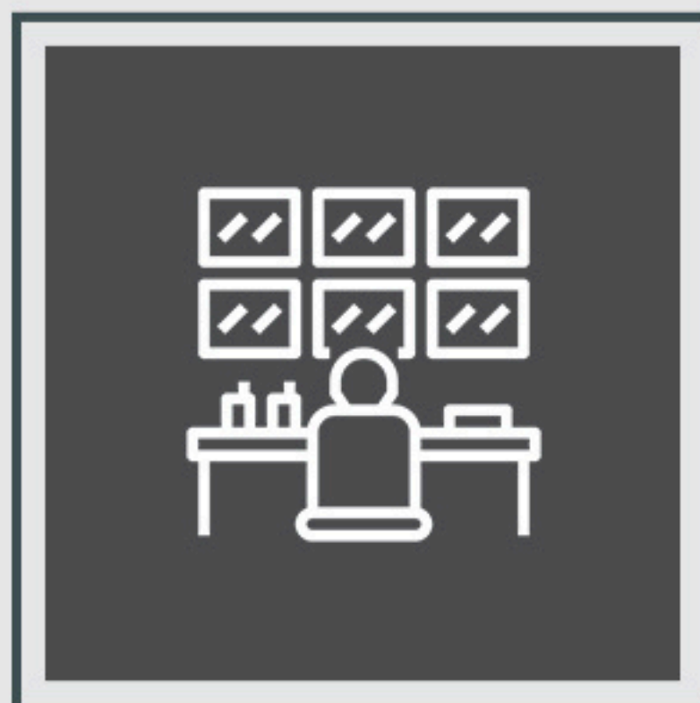
24/7 Security & Surveillance