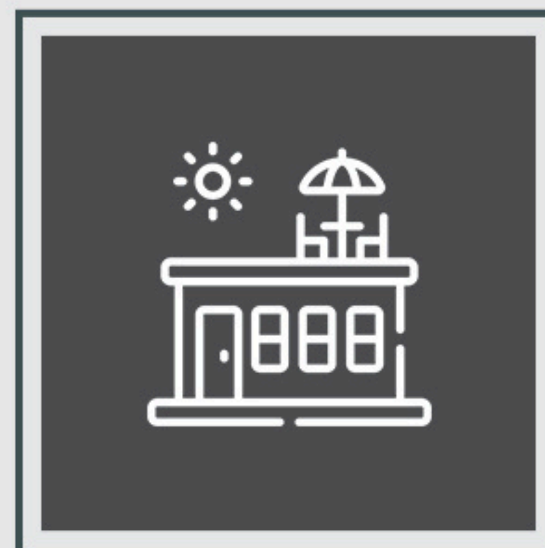
Rooftop Sitting Area