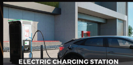
ELECTRIC CHARGING STATION